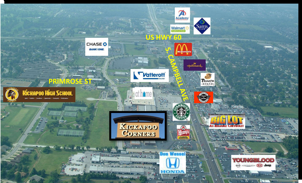
Kickapoo Corners View to the South